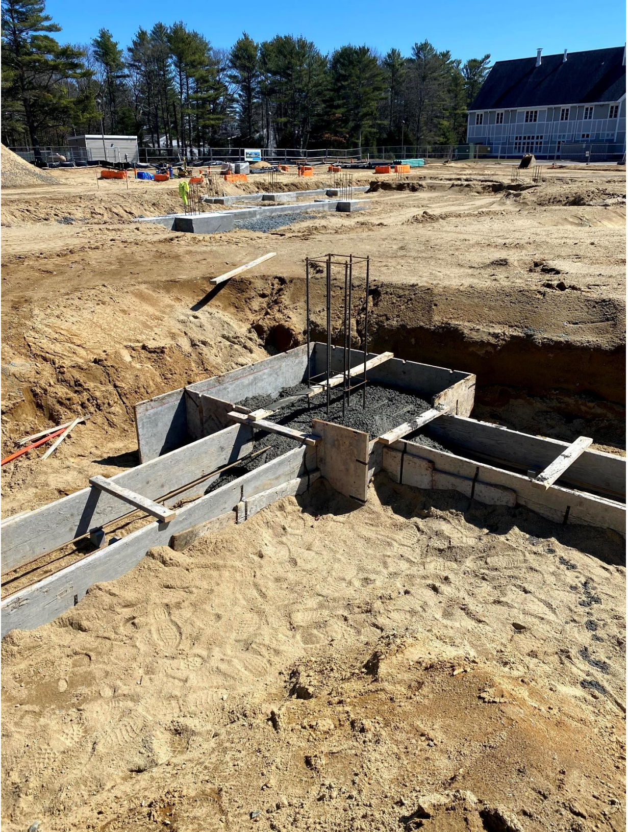
Concrete Poured in Forms