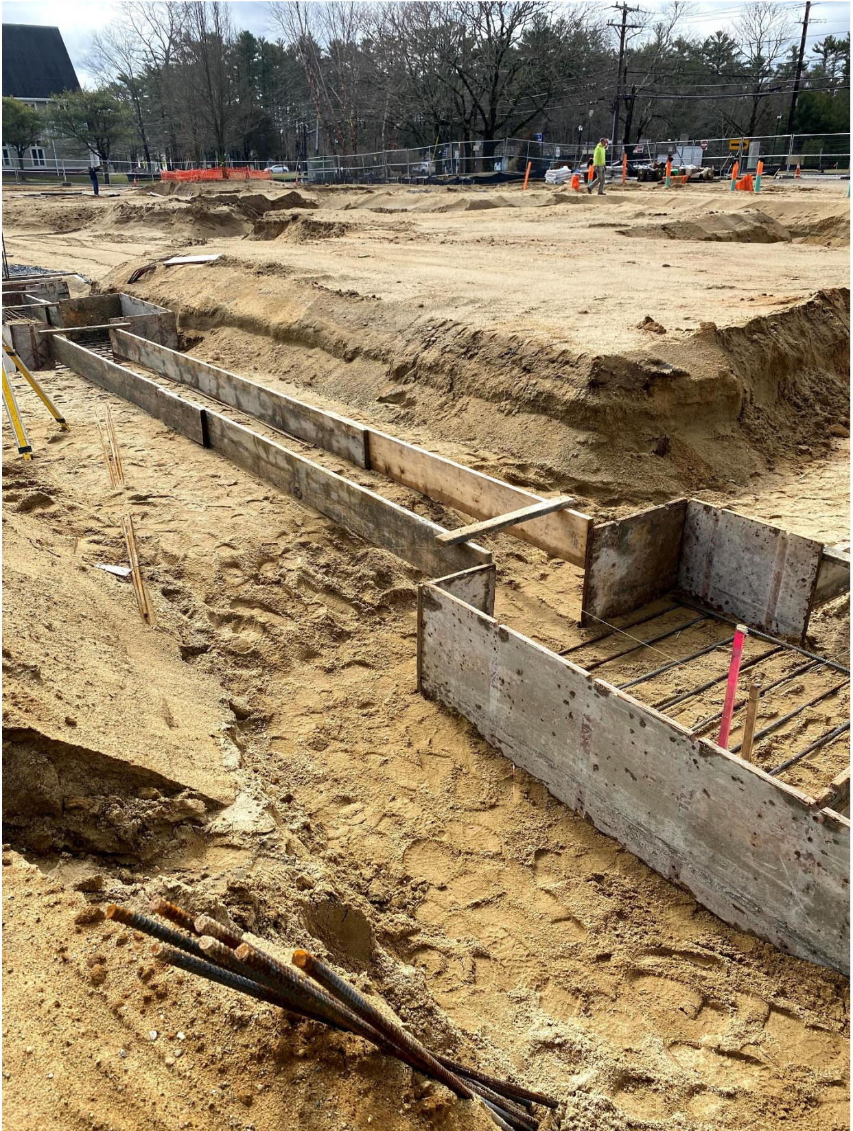
Footing Forms and Rebar