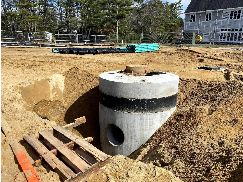
Site Drainage Structures