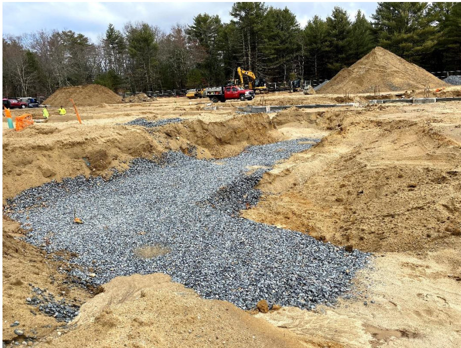
Installation and Backfill of Site Drainage Structures